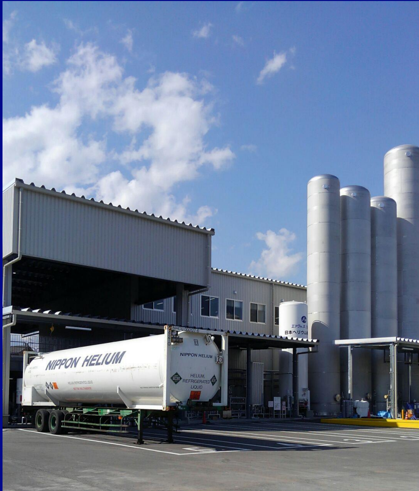
Center Plant Overview

— Ideal Helium Plant “Reduce losses to the minimum” —